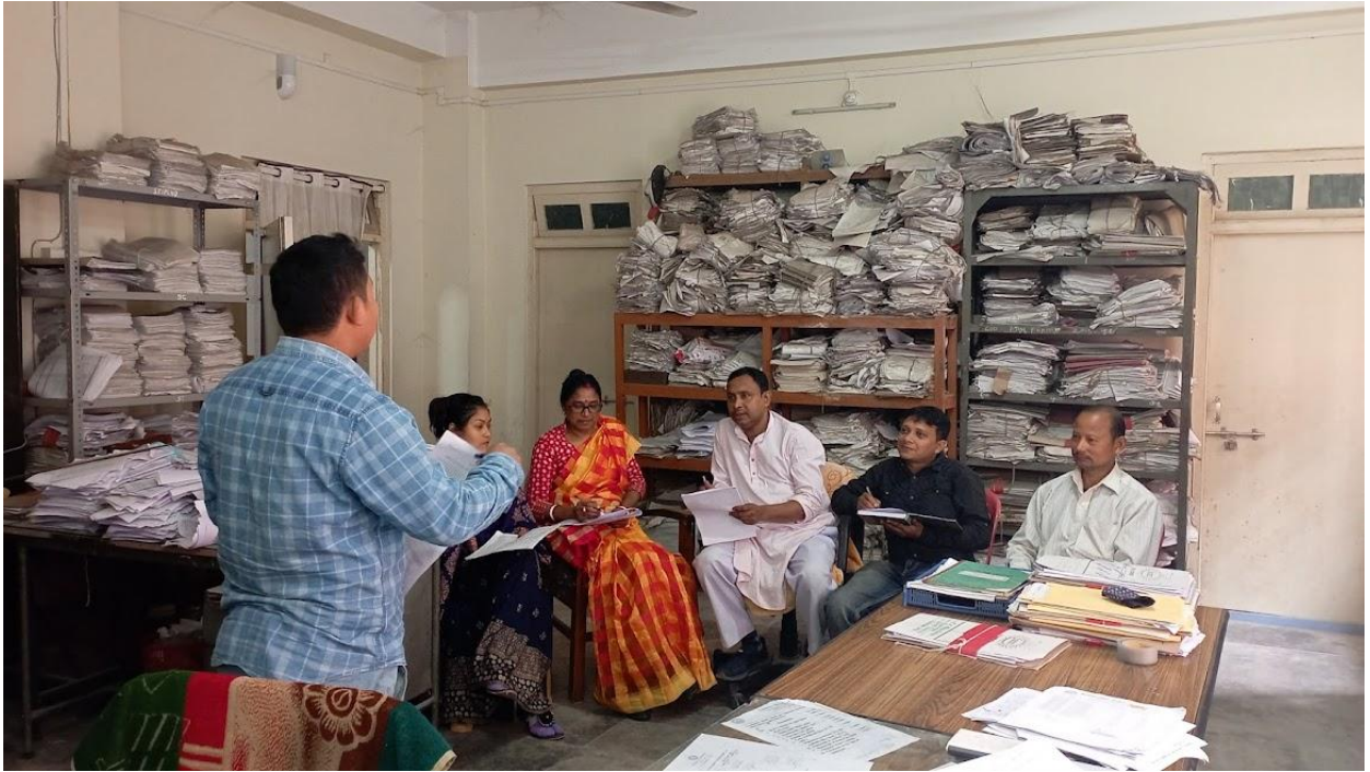
11. A Talk on 'Intellectual Property Rights' was held on 12.09.2019 by IQAC of Ramkrishna Mahavidyalaya in the college conference hall. The total participant was 28.